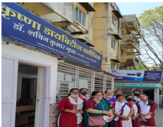
29-4-2022. Activity:- Visit to Krishna Diabetic Centre, Sanjay Complex Bhopal. Organisor;- Home Science Department.

A-2/2, Nagarjun Nagar, Gopal Nagar, Bhopal, Madhya Pradesh 462024, India Latitude 23.24209283° Longitude 77.49111487° Local 11:16:45 AM Altitude 415.06 meters GMT 05:46:45 AM Friday, 11-03-2022